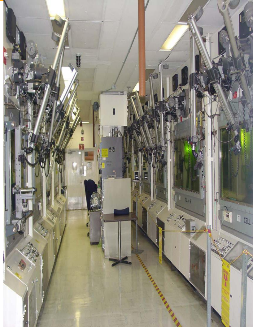
Remote Operations Area