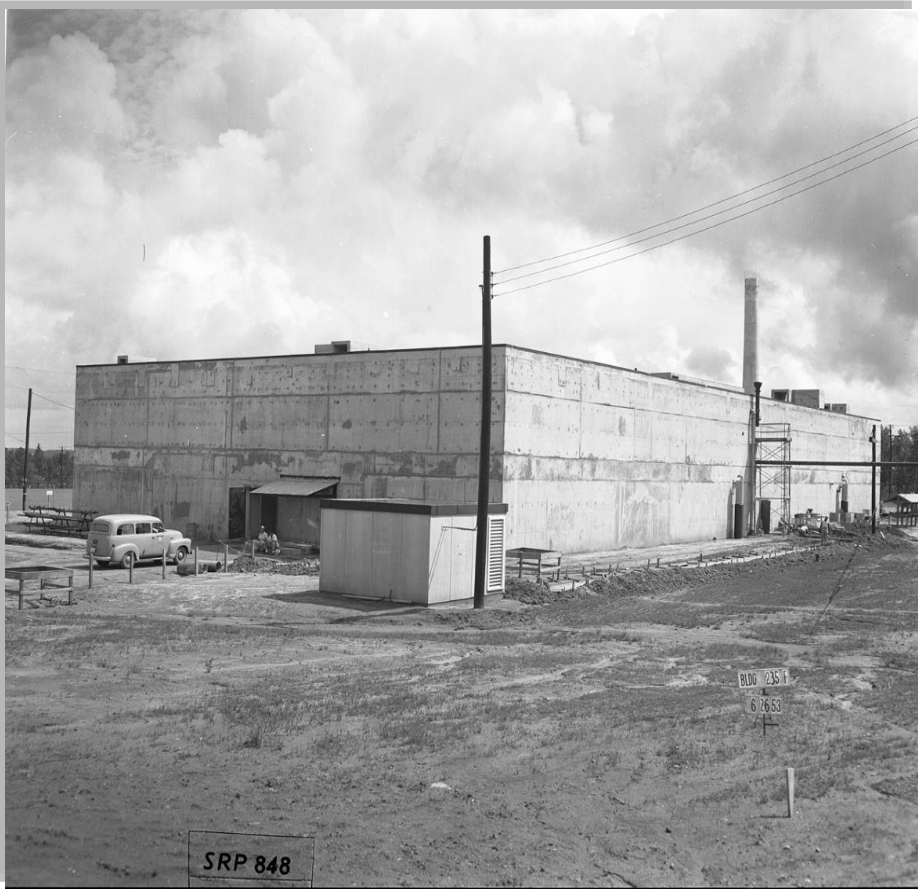
Early Construction of 235-F